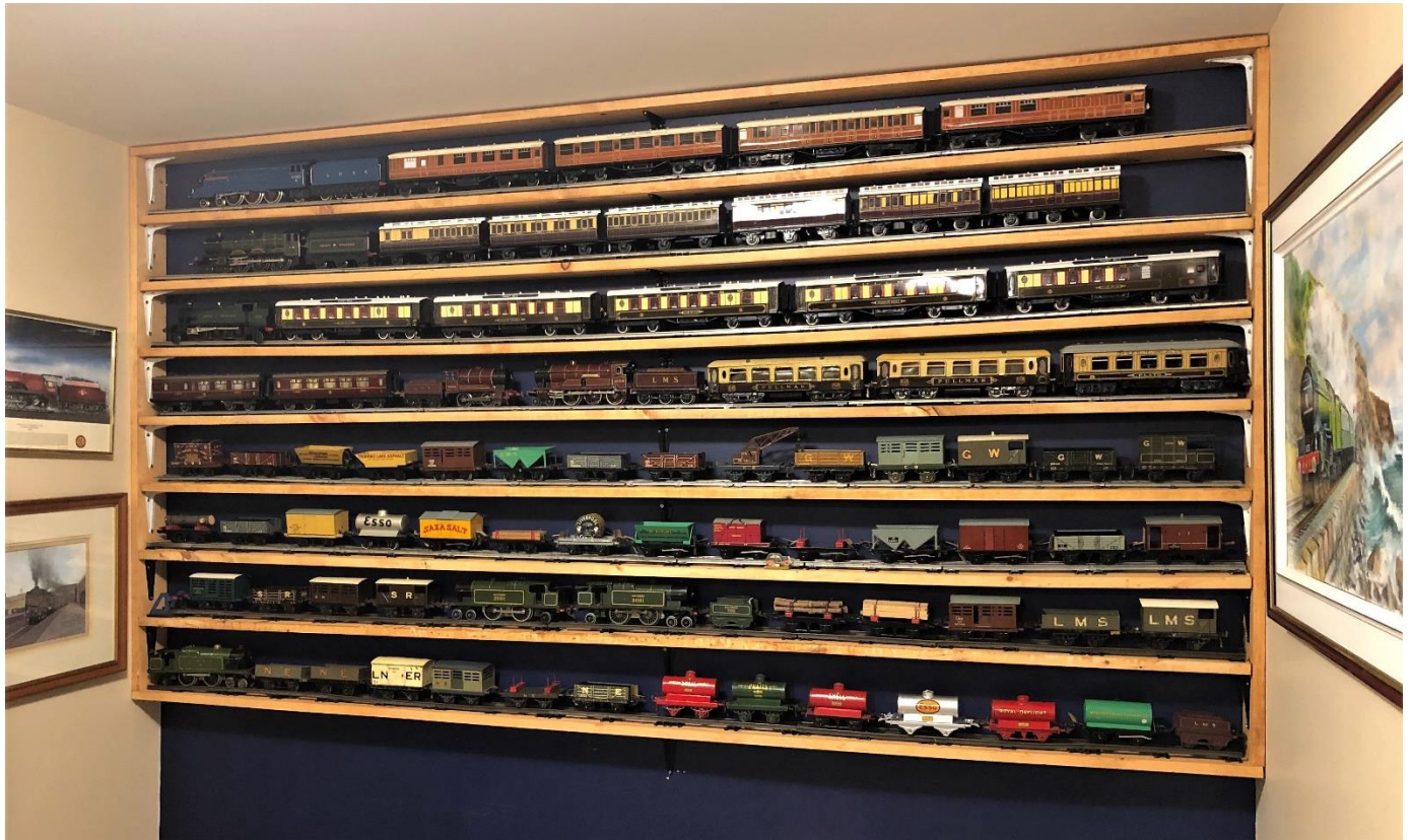
Bassett Lowke, Hornby, Ace and Darstaed. Trains spanning almost one hundred years.