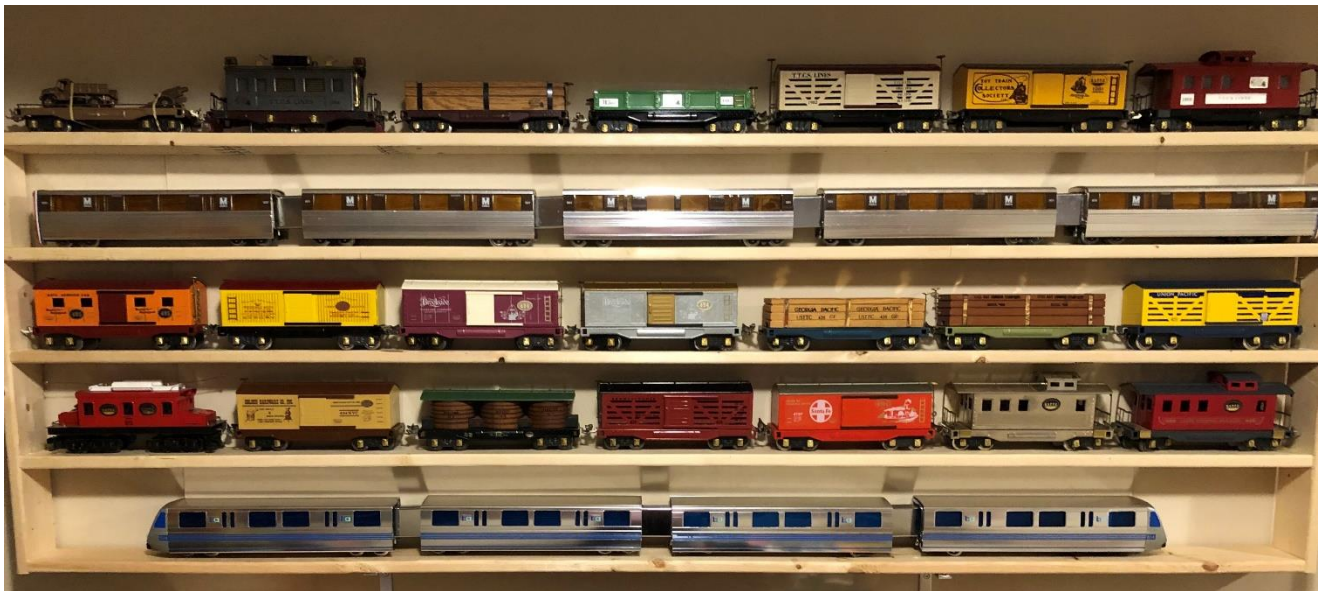
Products by the United States Toy Train Company, a small manufacturer active in the 70's and 80's. The bottom shelf contains a model of a SAN Francisco BART rapid transit train. 2 nd shelf down is a model of the Washington DC Metro rapid transit train.