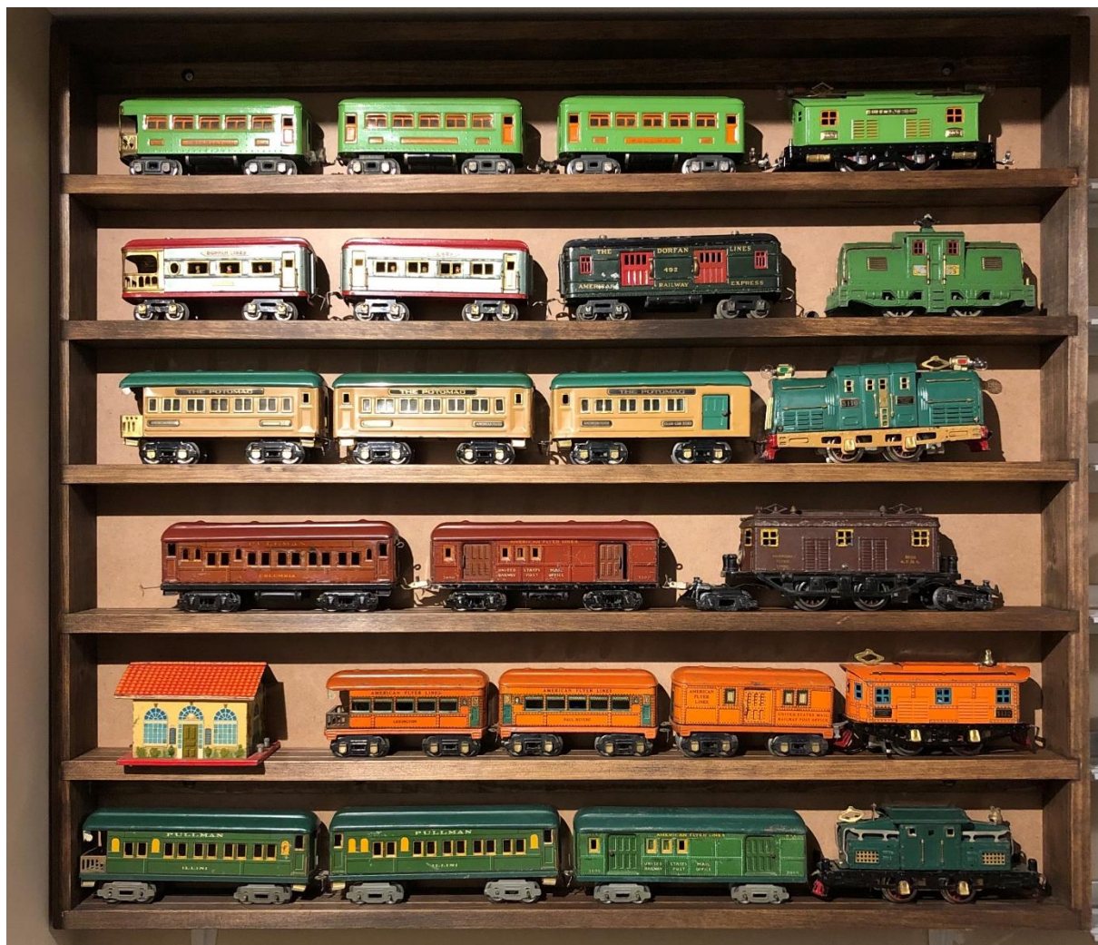
Prewar trains by Lionel, American Flyer and Dorfan (the American successor to Germany's Fandor Company)