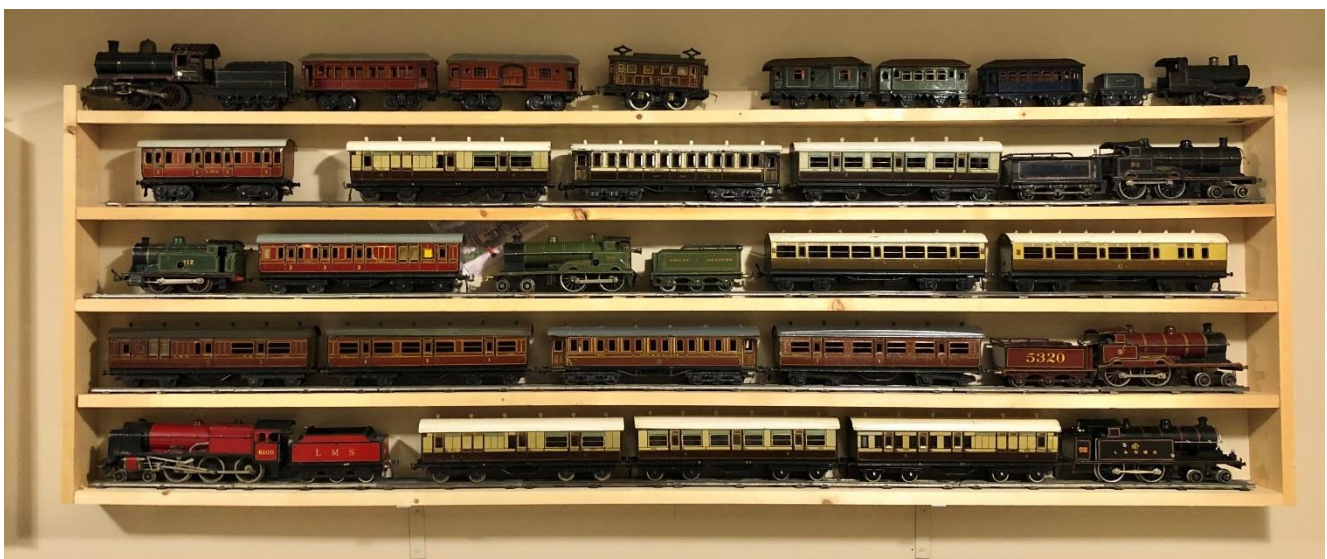
Bing, Bing for Bassett-Lowke and Bassett-Lowke