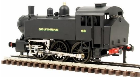
USA Tank – Southern Black 68