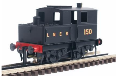
Sentinel – LNER Black 150