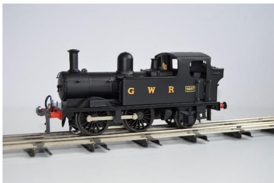
48XX – GWR Black 4807