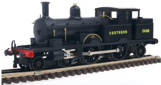
Adams Radial – Southern Black 3488

I am calling it Black-loco Day and it is limited strictly to the items listed below that are ordered before the end of November 2022 and subject to stock availability – some of these are now extremely limited and once they are gone, they are gone!