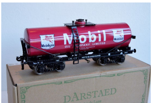
Darstaed Mobil Bogie Tank Wagon New Old Stock