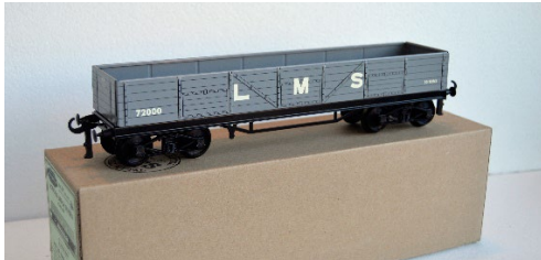
WJV High-Capacity Bogie Wagon – LMS