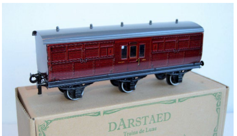
Darstaed LMS 6-Wheel Horse Box New Old Stock