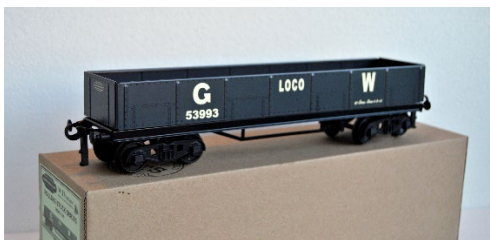
WJV High-Capacity Bogie Wagon – GWR (Low flange 2-rail wheels fitted)