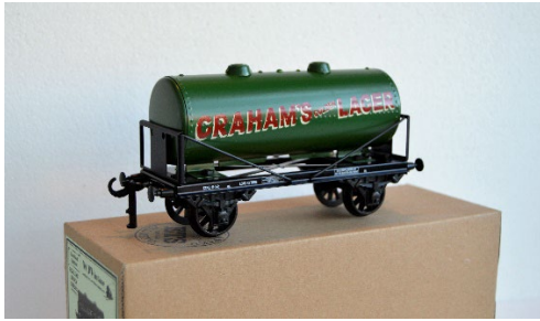
WJV Graham's Golden Lager Tank Wagon