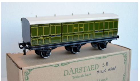
Darstaed SR 6-Wheel Milk Van Pre-owned (A Cliff Collection) Looks unused (Box is marked in pen)