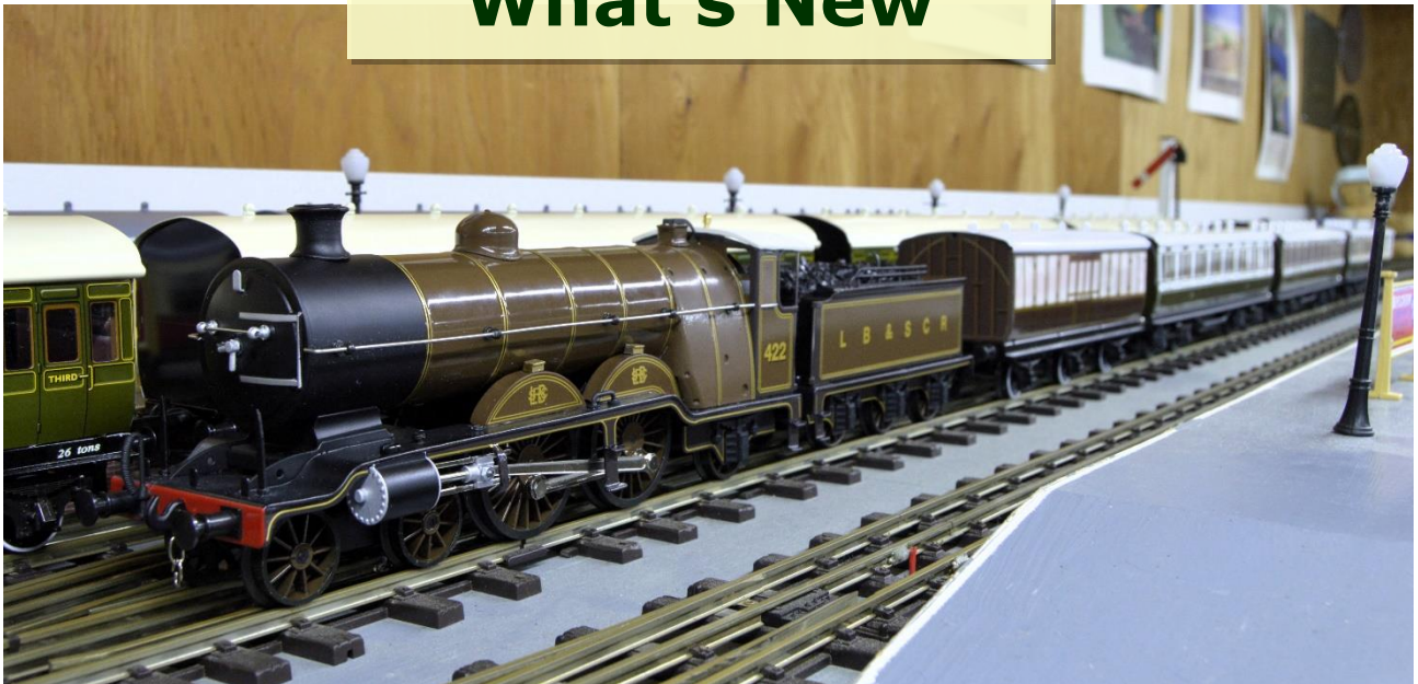
LBSCR H2 4-4-2 'Brighton' Atlantic