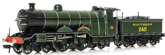
Lined Maunsell Green